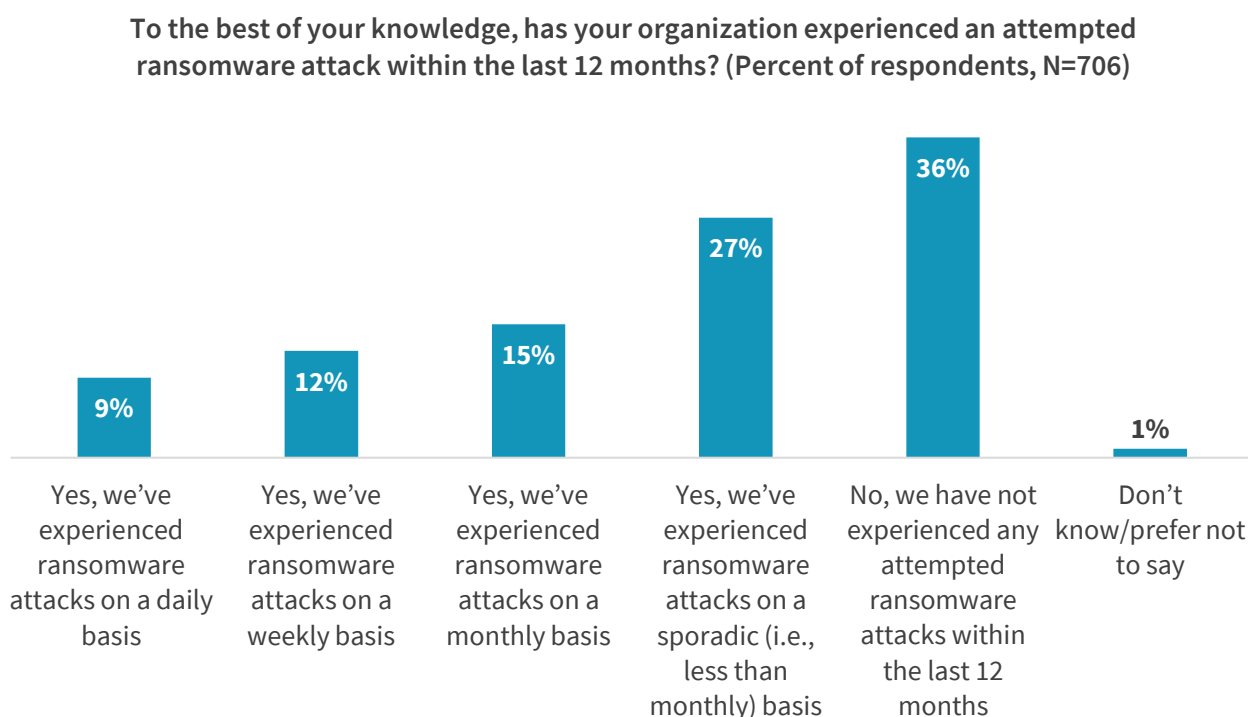
Figure 1. Sixty-three Percent of Respondents Experienced Ransomware Attacks in the Last 12 Months