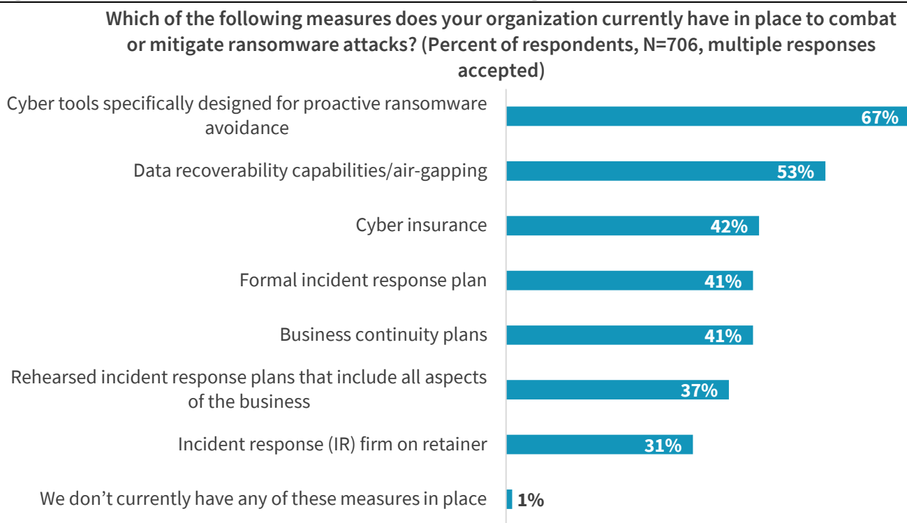
Figure 2. Common Measures in Place to Combat or Mitigate Ransomware